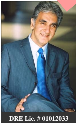
DRE Lic. # 01012033

*Prices subject to change without prior notice. Information deemed reliable, but not guaranteed. Sq. Ft. approximate. Buyer to verify. Sq. Ft. does not include bonus areas, storage areas, patios or garages.