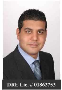
DRE Lic. # 01862753